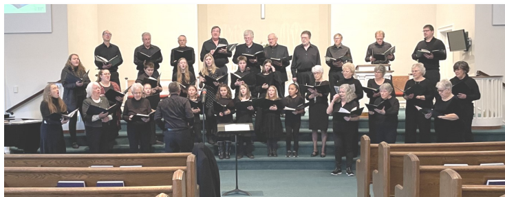
The Intergenerational Choir providing pre-service music

Wondering what's going on in and around Mosaic Conference? See current & past issues of Mosaic News - their weekly e-newsletter - by clicking here.